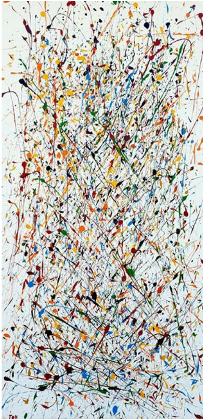
Tom Wagener Wildflowers , 2020 Acrylic on canvas, 200 x 100 cm